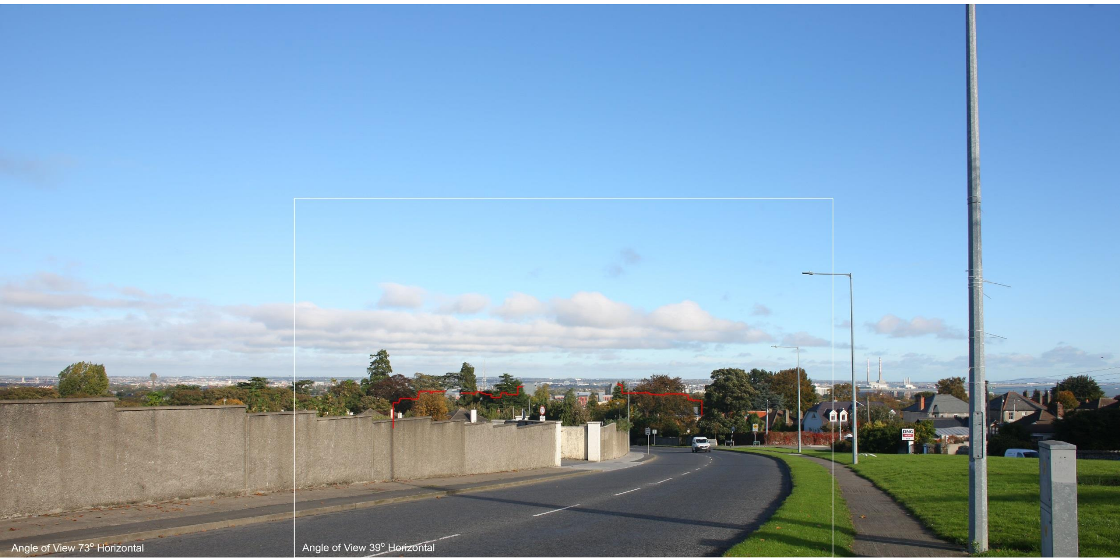
Angle of View 73° Horizontal