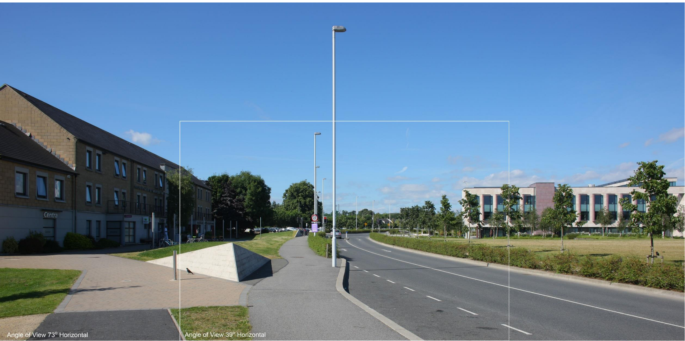
Angle of View 73° Horizontal