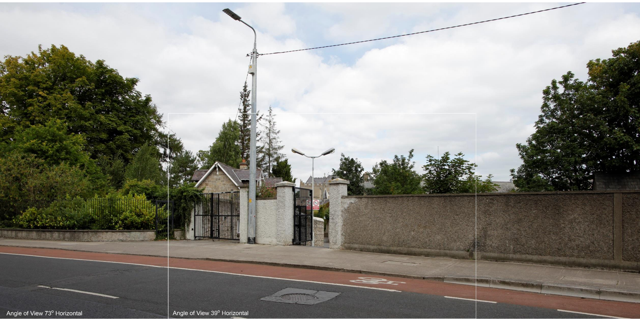
Angle of View 73° Horizontal