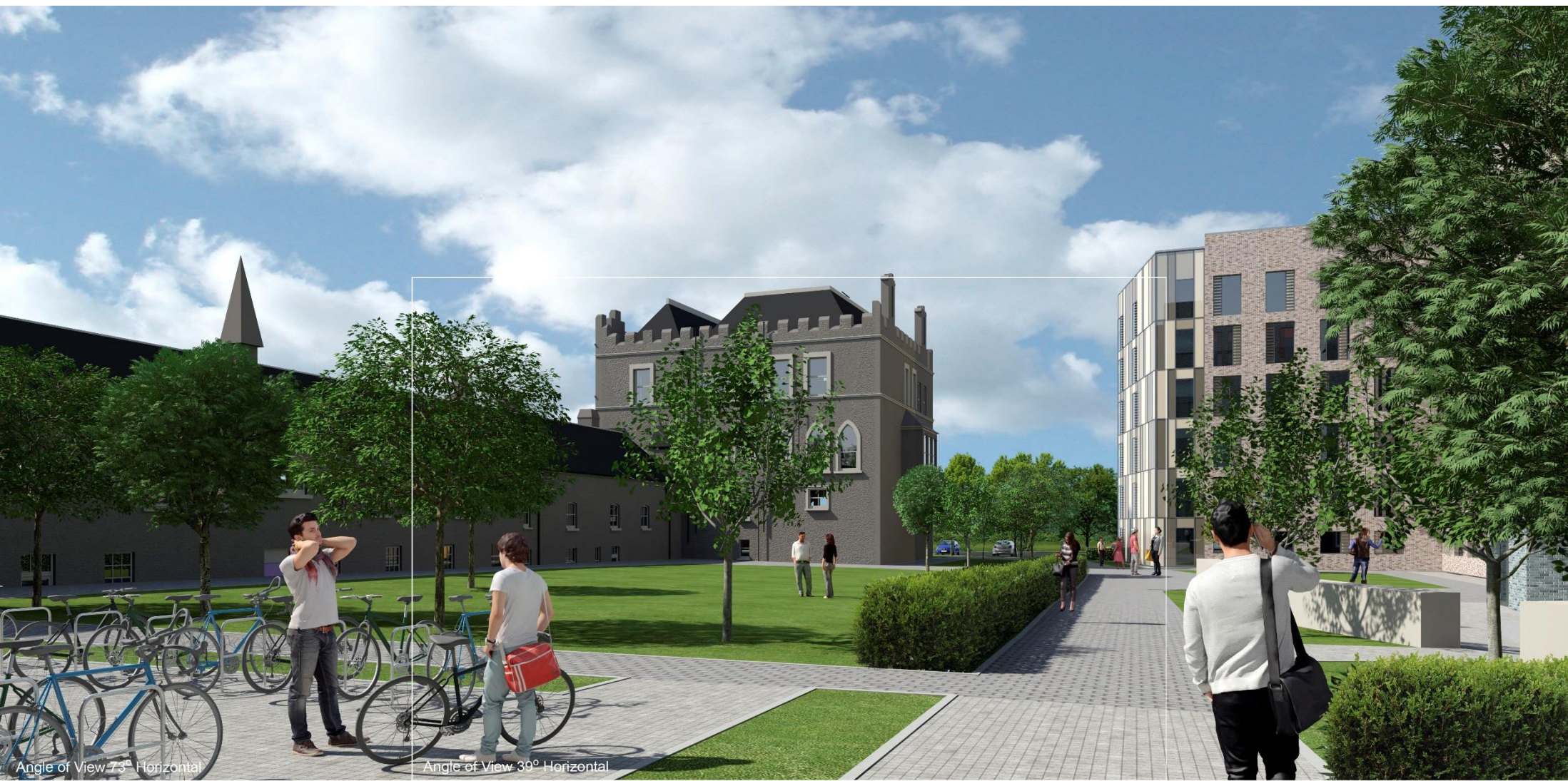
Angle of View: 7.3° Horizontal