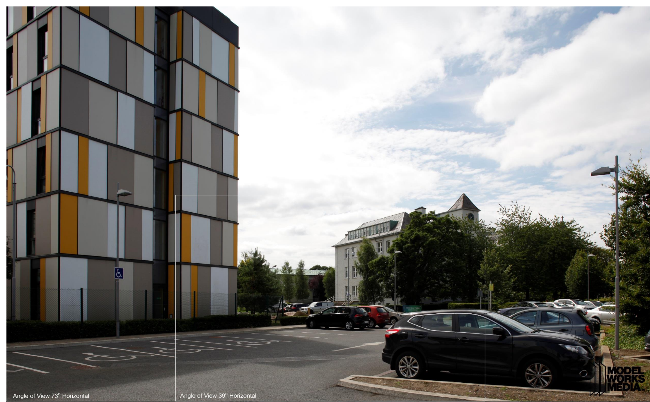
Angle of View 73° Horizontal