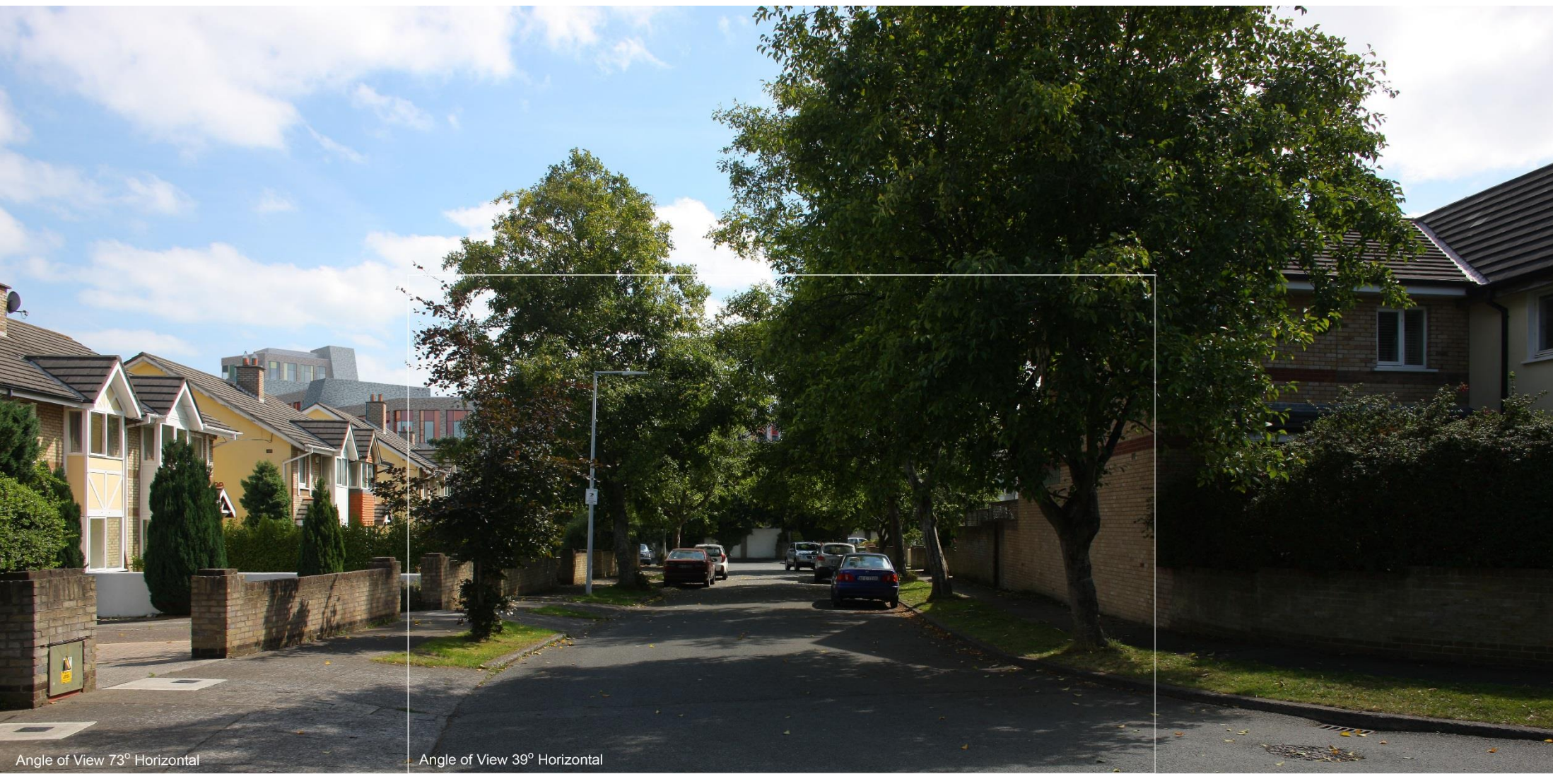
Angle of View 73° Horizontal