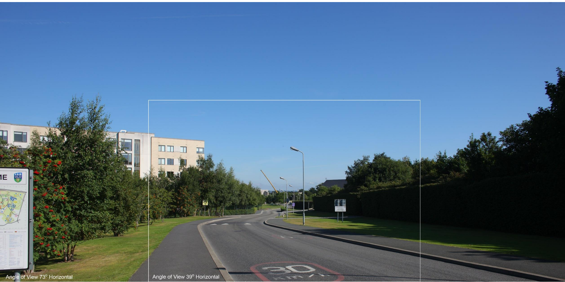
Angle of View 73° Horizontal