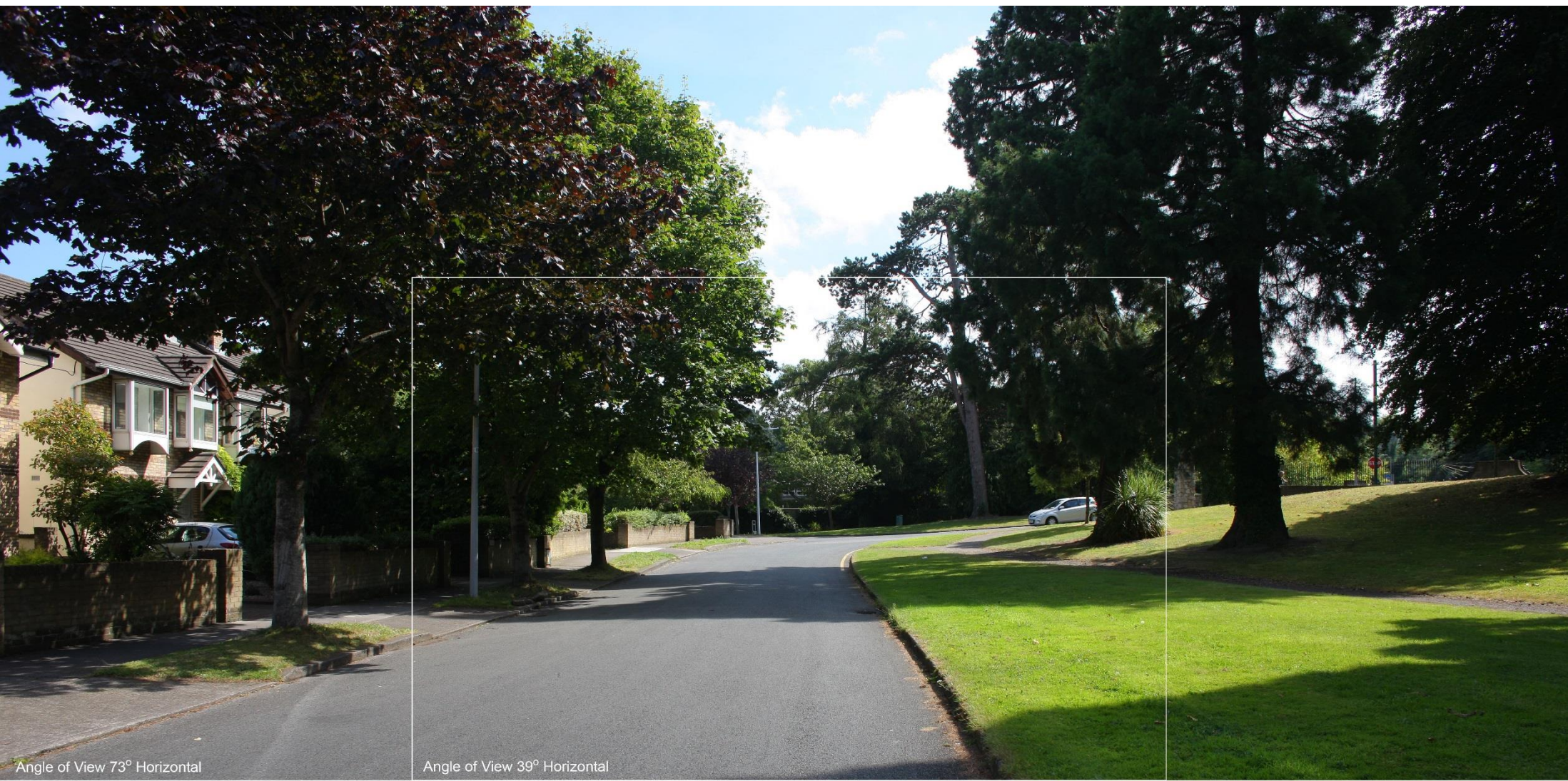
Angle of View 73° Horizontal