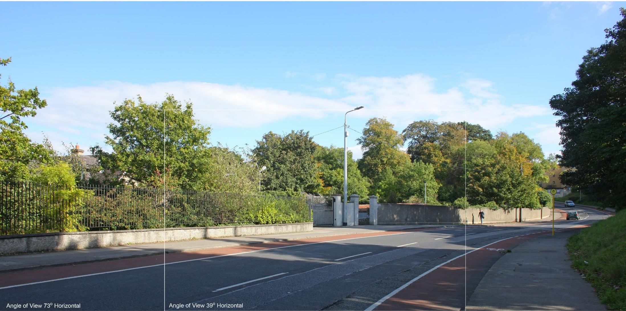
Angle of View 73° Horizontal