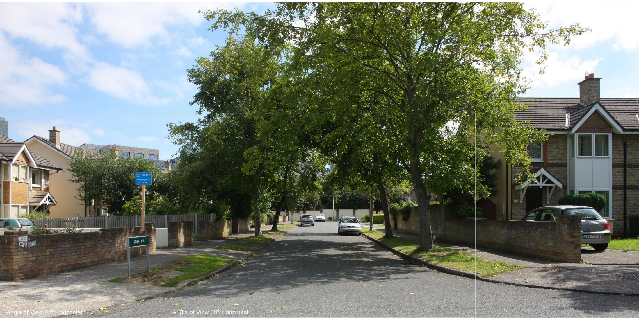
Angle of View 73° Horizontal