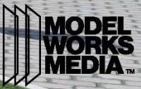
Angle of View 39° Horizontal

VISUAL IMPACT ASSESSMENT T. +353 1 2899 039