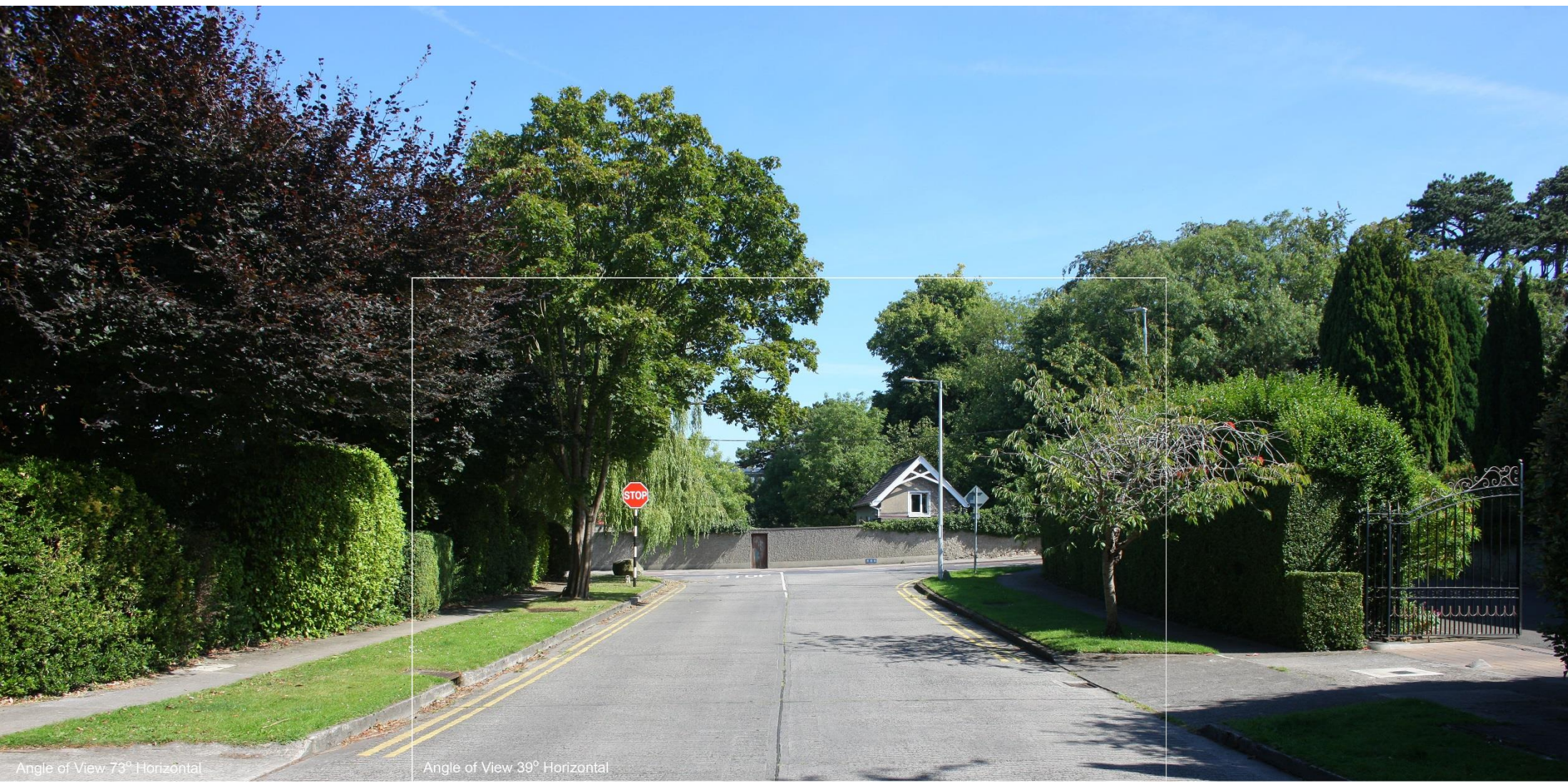
Angle of View 73° Horizontal