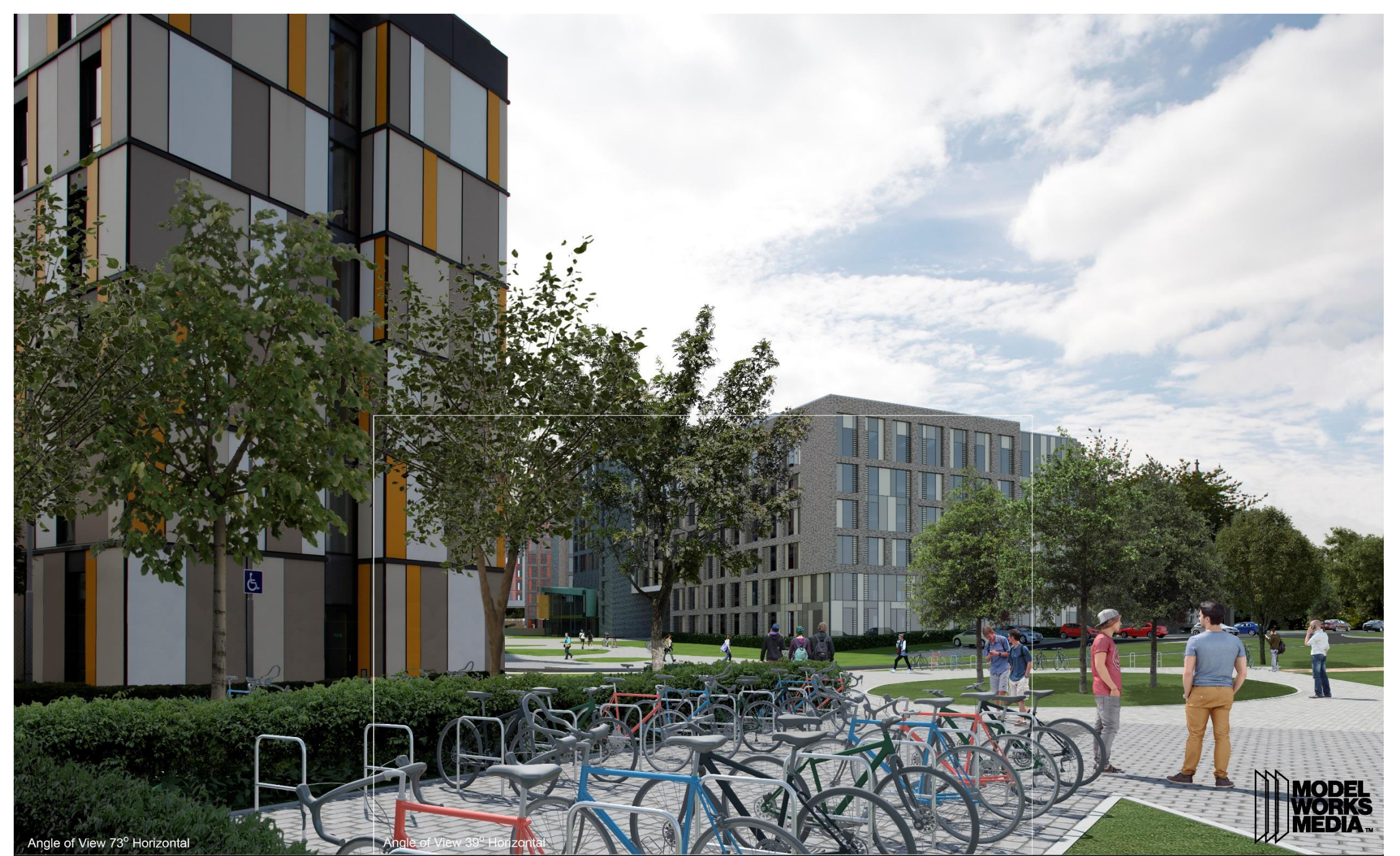
Angle of View 73° Horizontal