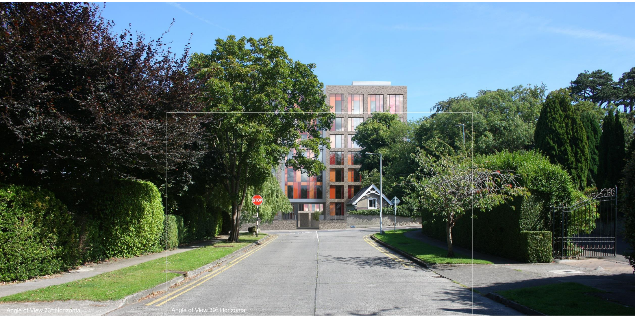
Angle of View 73° Horizontal