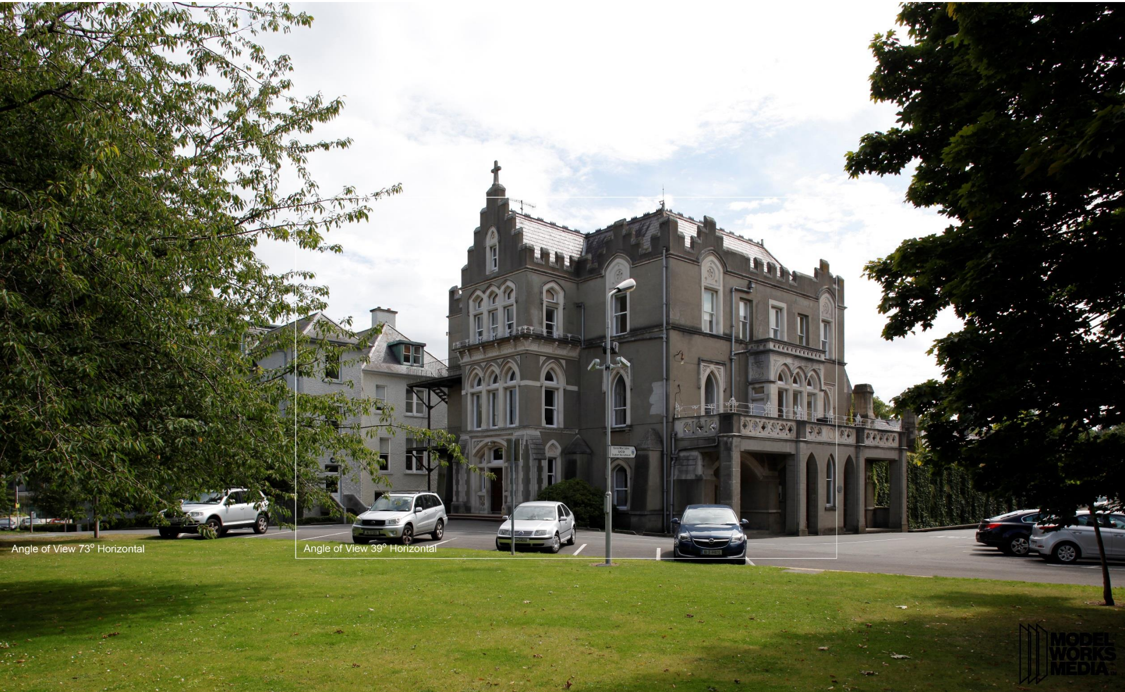
Angle of View 73° Horizontal