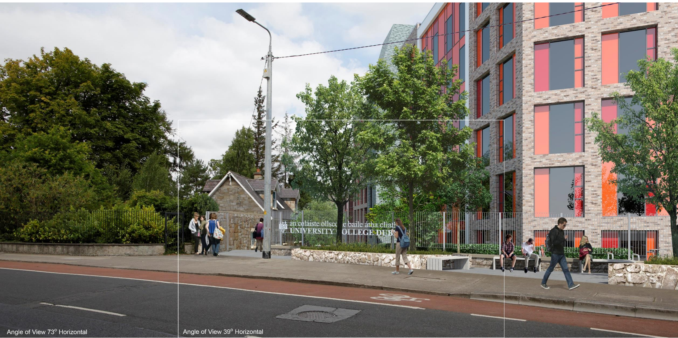
Angle of View 73° Horizontal