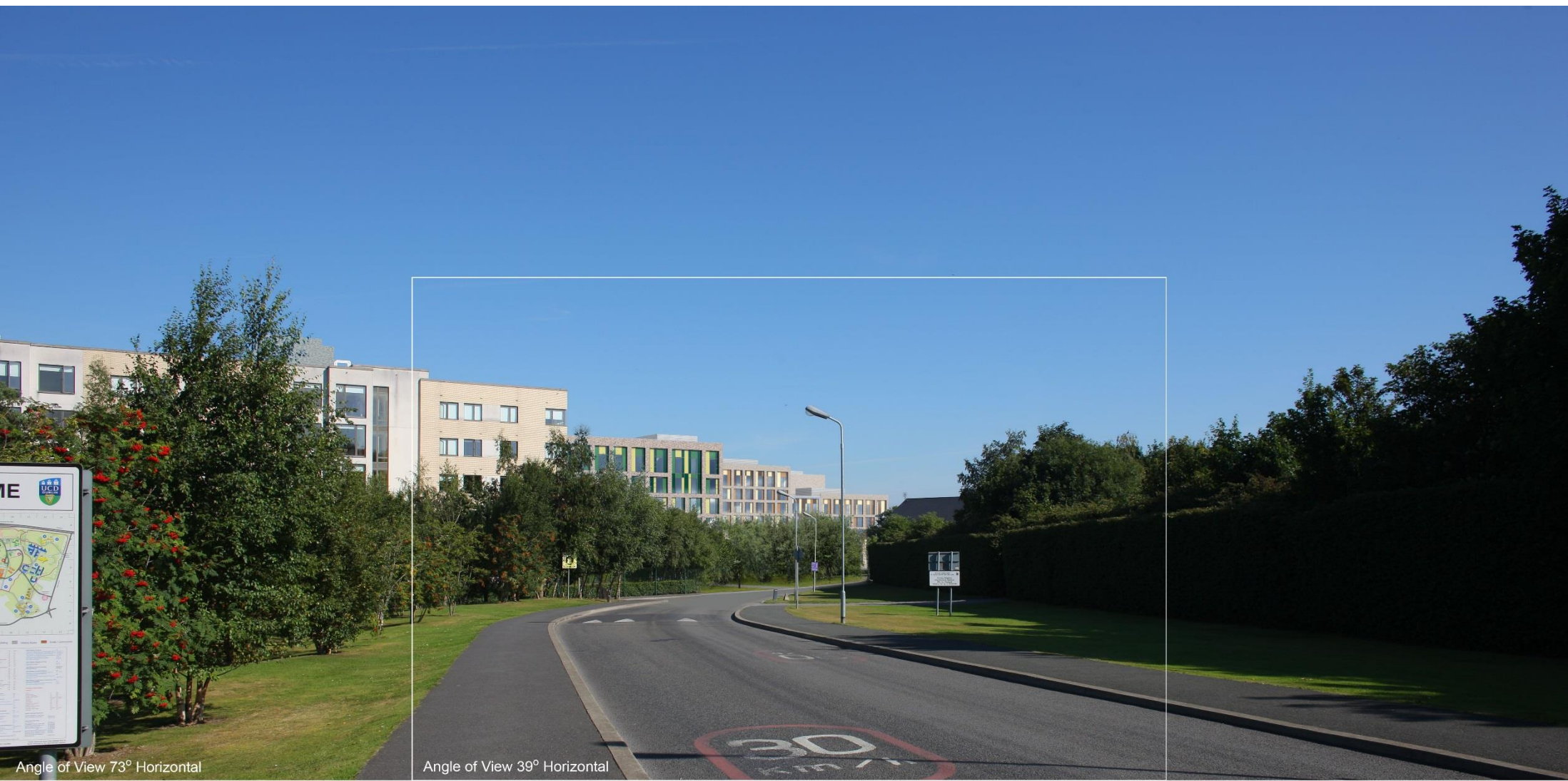
Angle of View 73° Horizontal