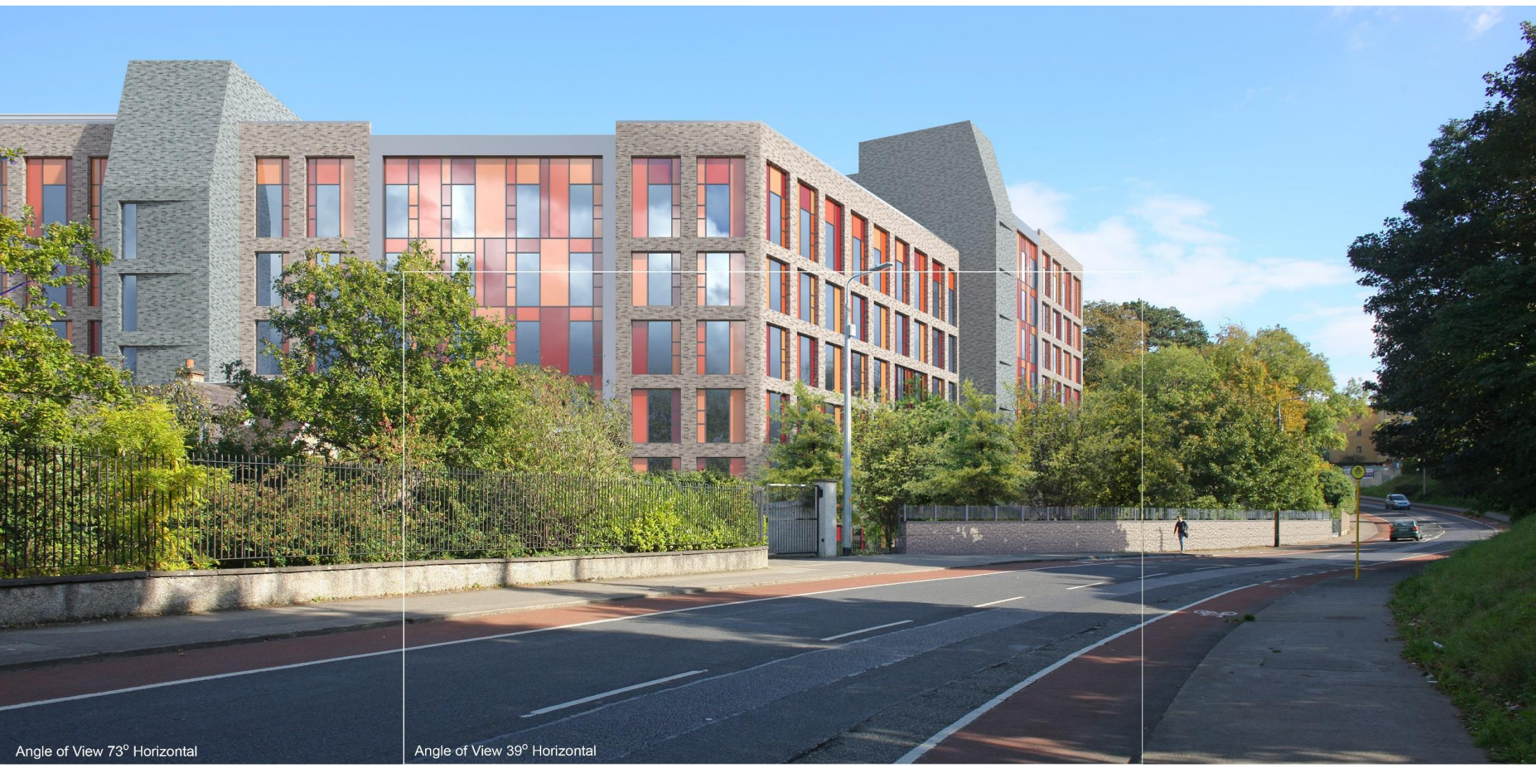
Angle of View 73° Horizontal