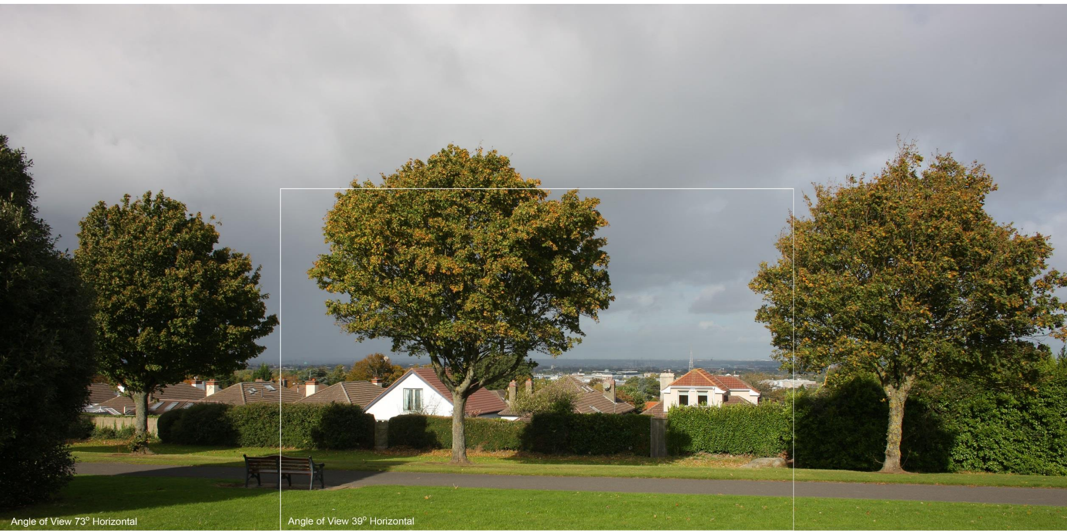
Angle of View 73° Horizontal