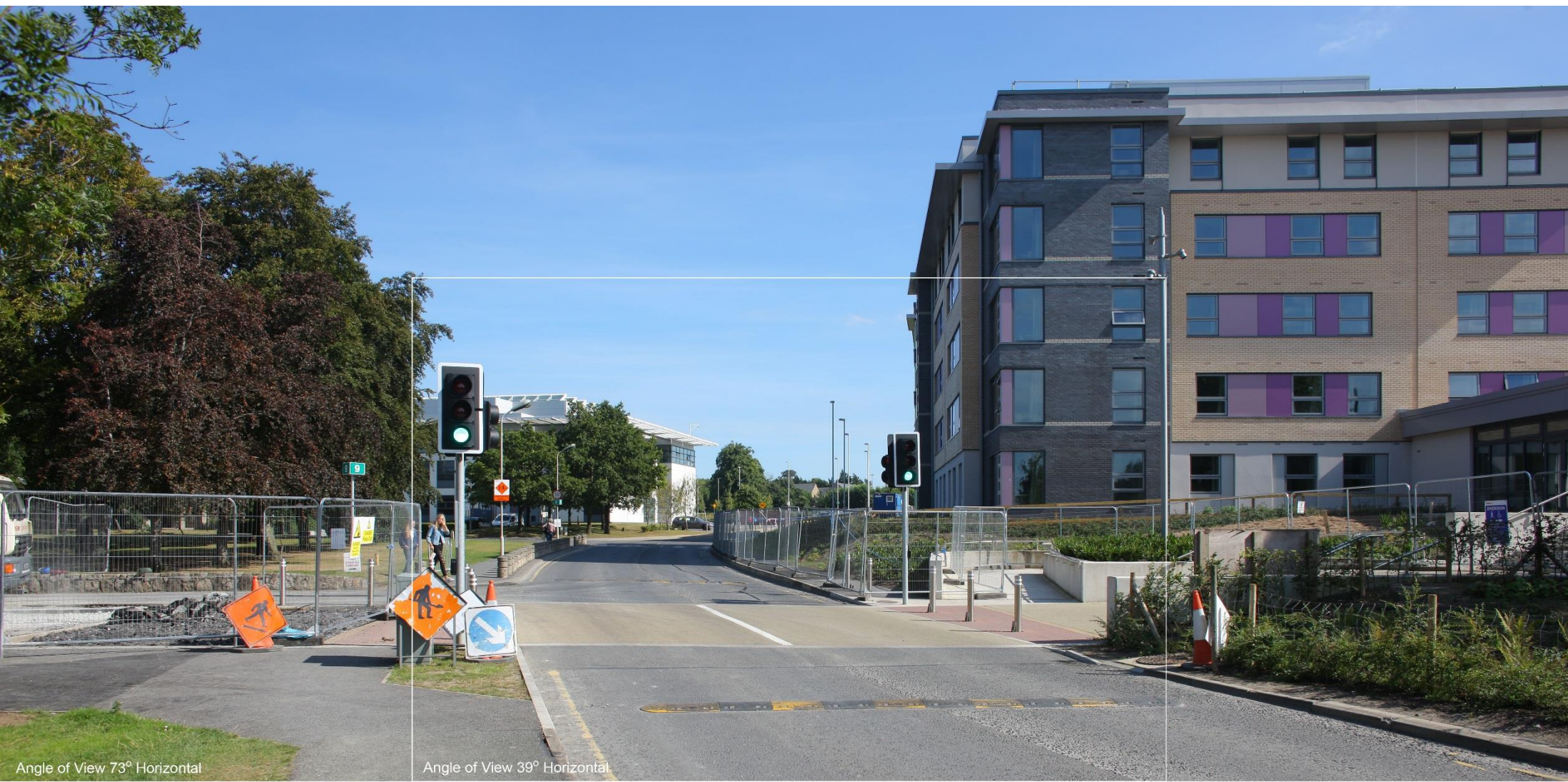
Angle of View 73° Horizontal