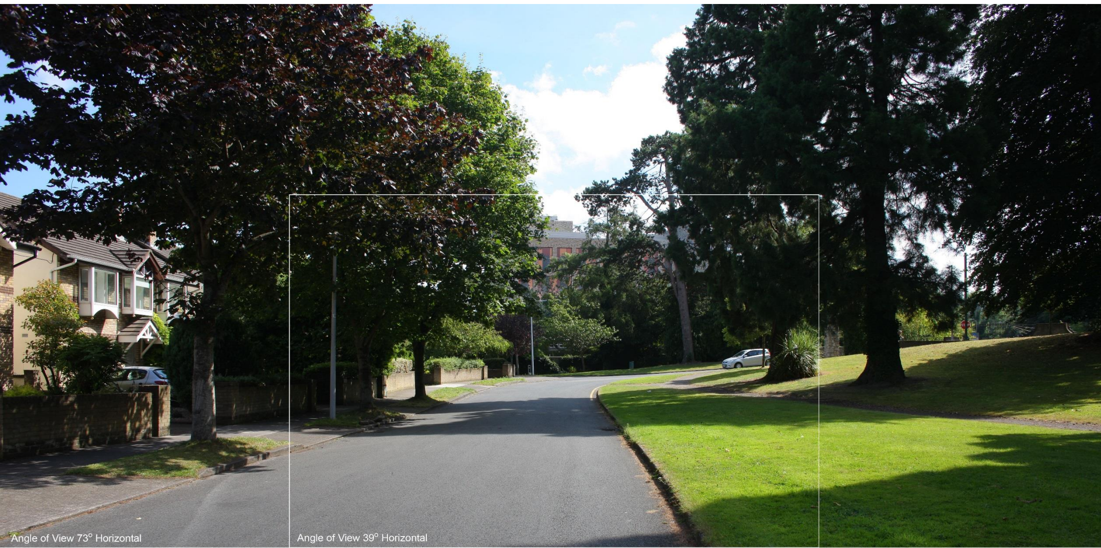
Angle of View 73° Horizontal