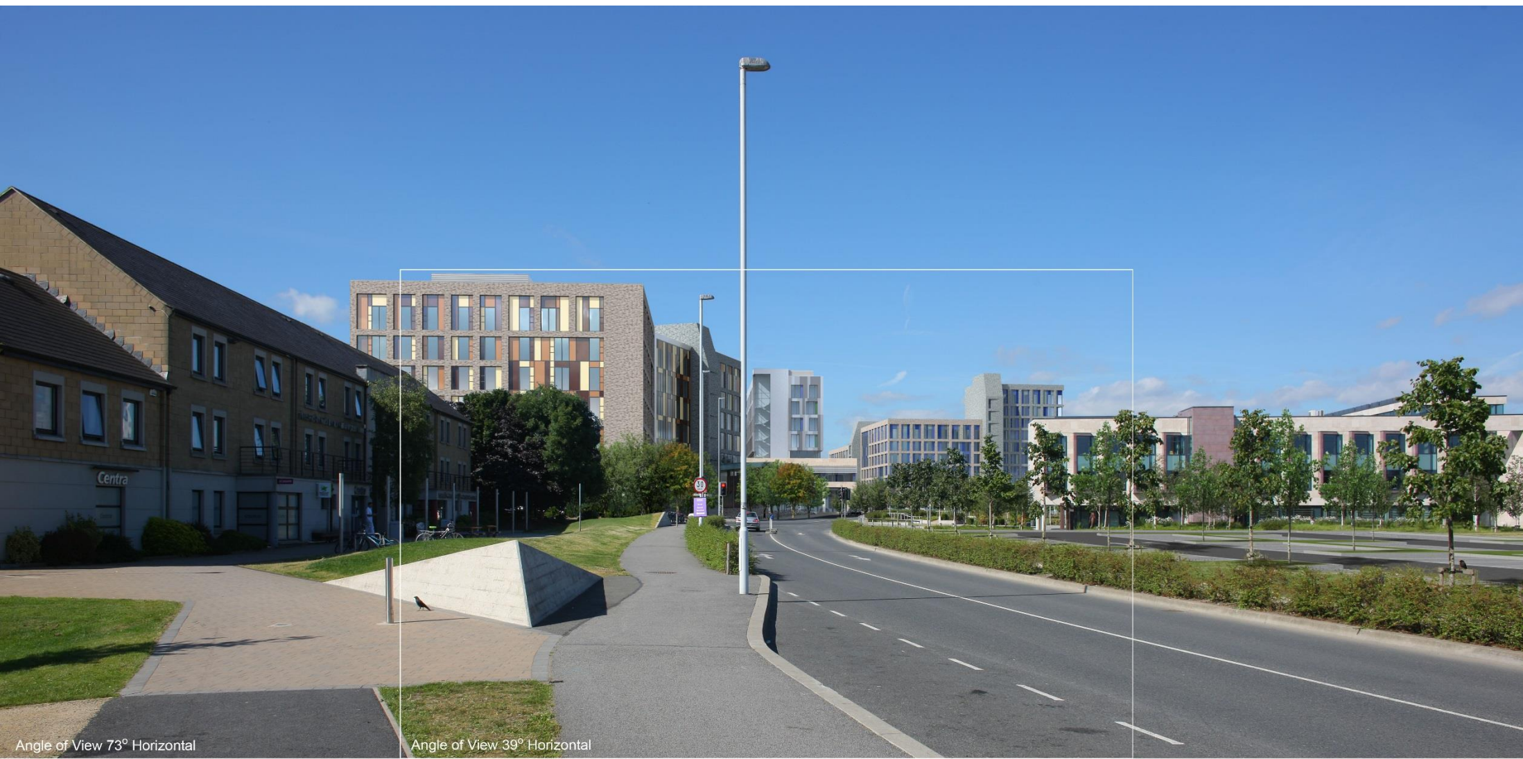
Angle of View 73° Horizontal